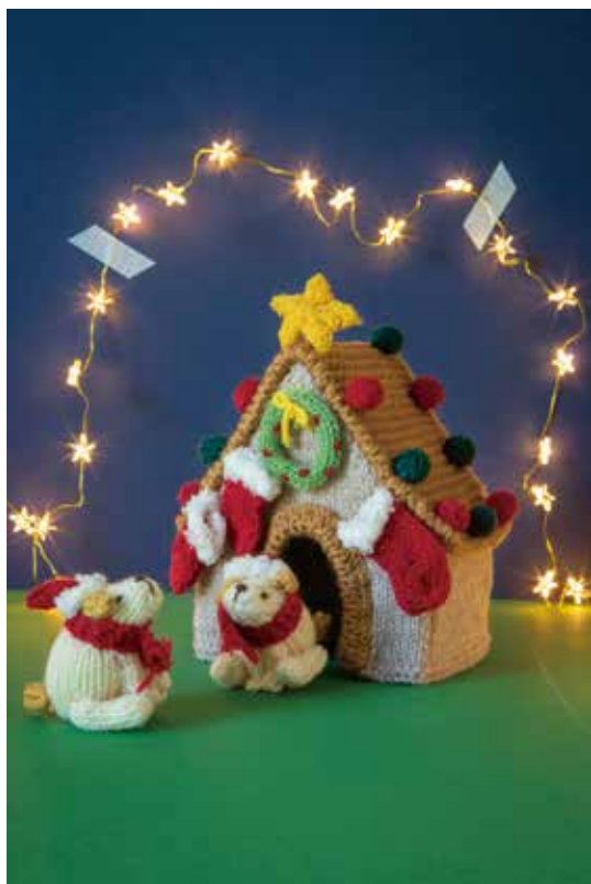
Designed by Sachiyo Ishii